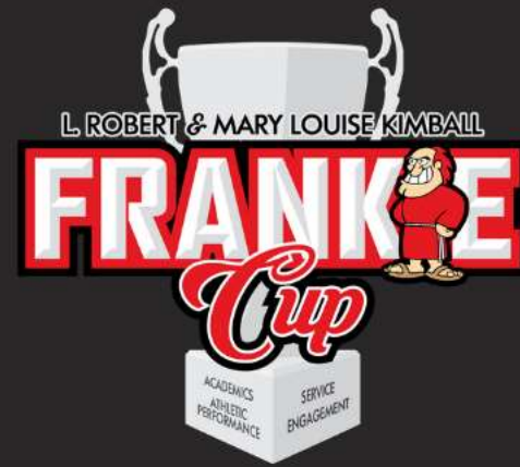
FRANKIE CUP POINTS